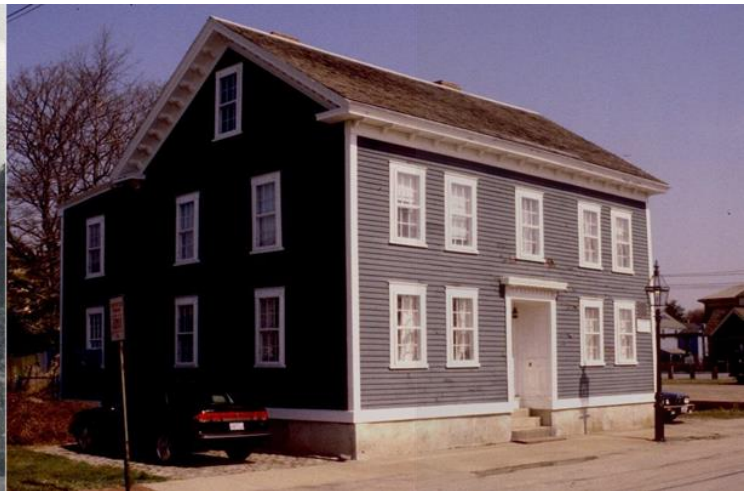
51 Bridge St.