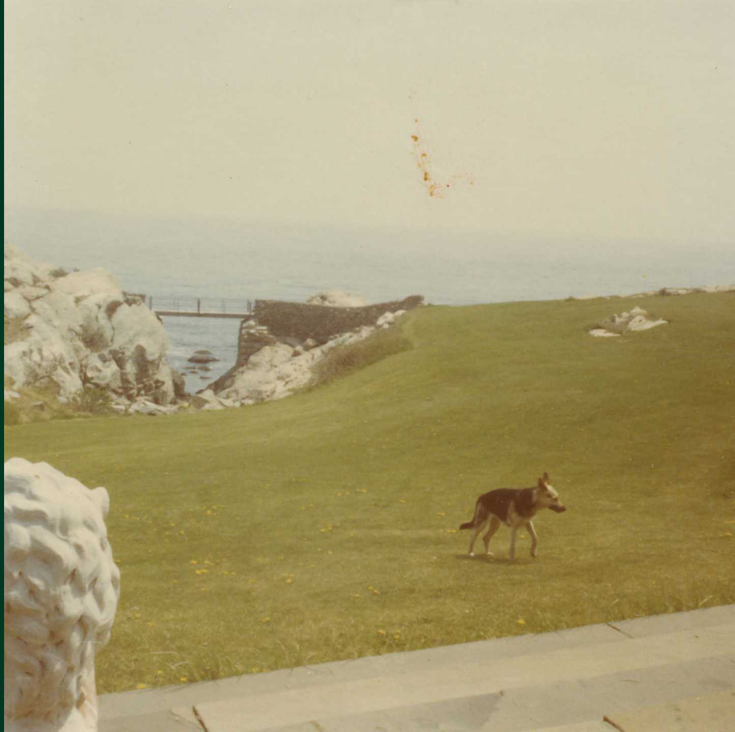
Ca. 1968.