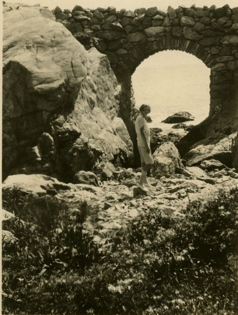
Doris Duke in front of the bridge, ca. 1925.