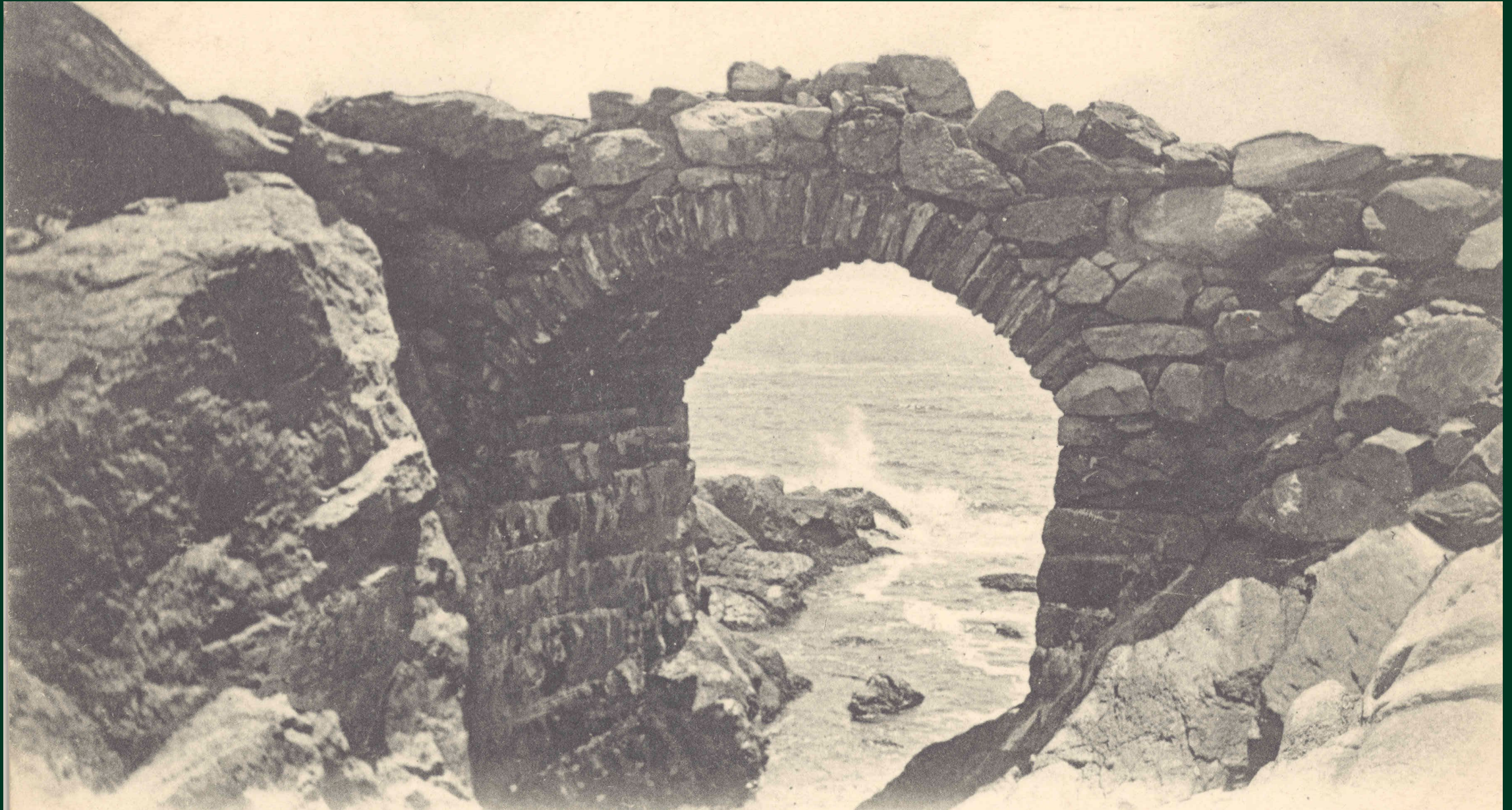
7 918 Stone Arch, Cliff Walk, "Rough Point", Newport, R. I.