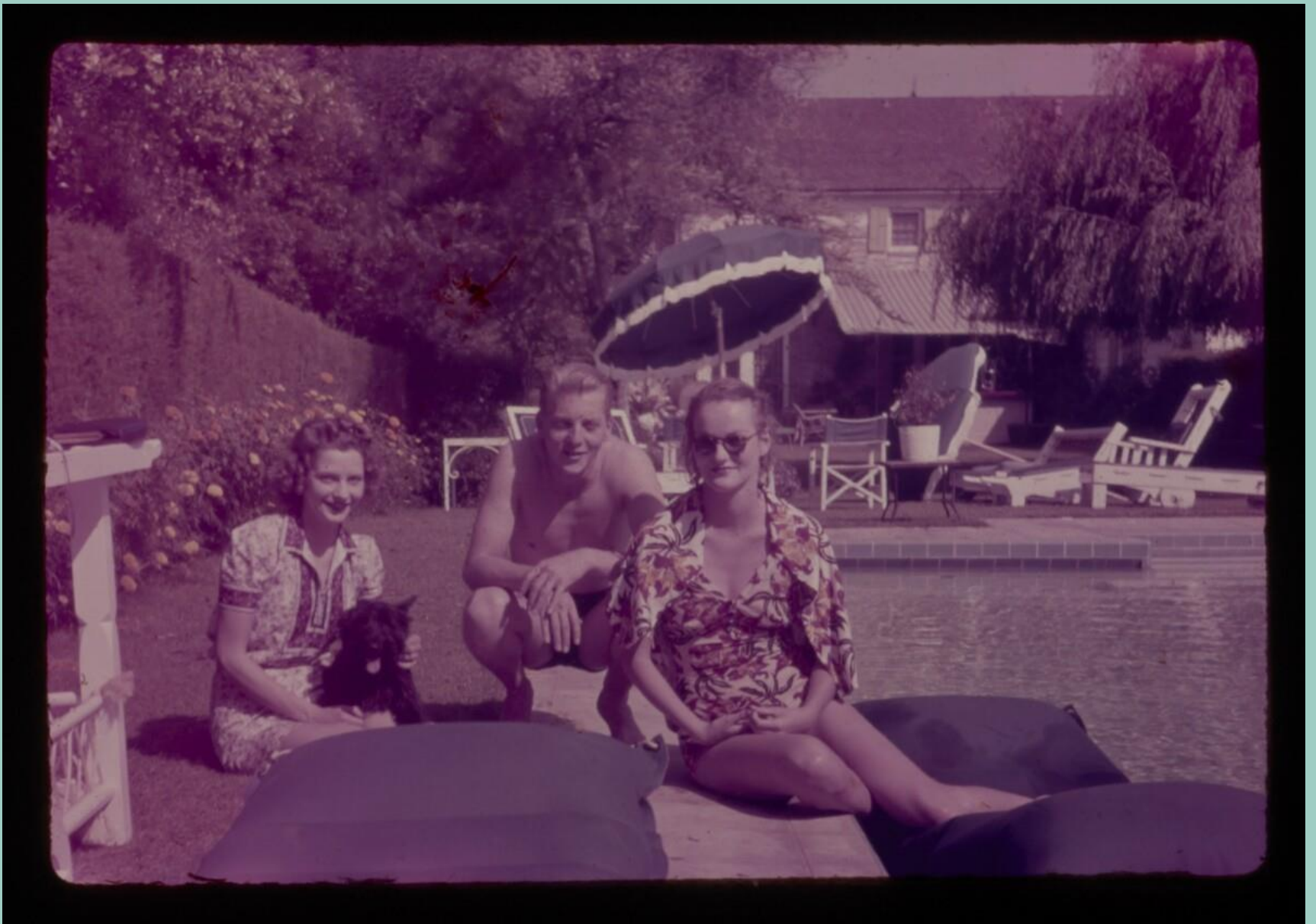
Doris Duke and friends, ca. 1938