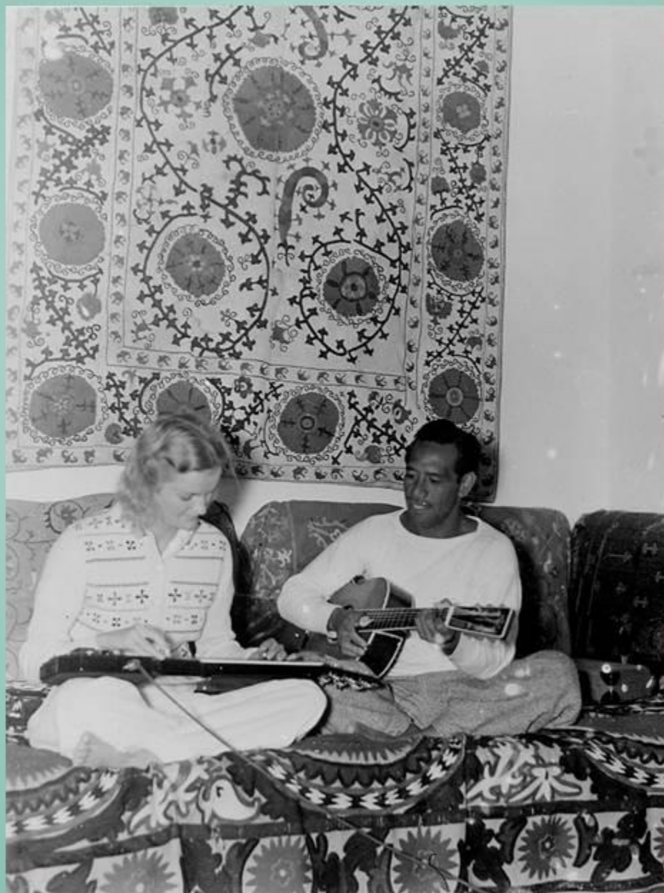
Doris Duke and Sam Kahanamoku playing Hawaiian slack key guitar. Shangri La, c.1940.