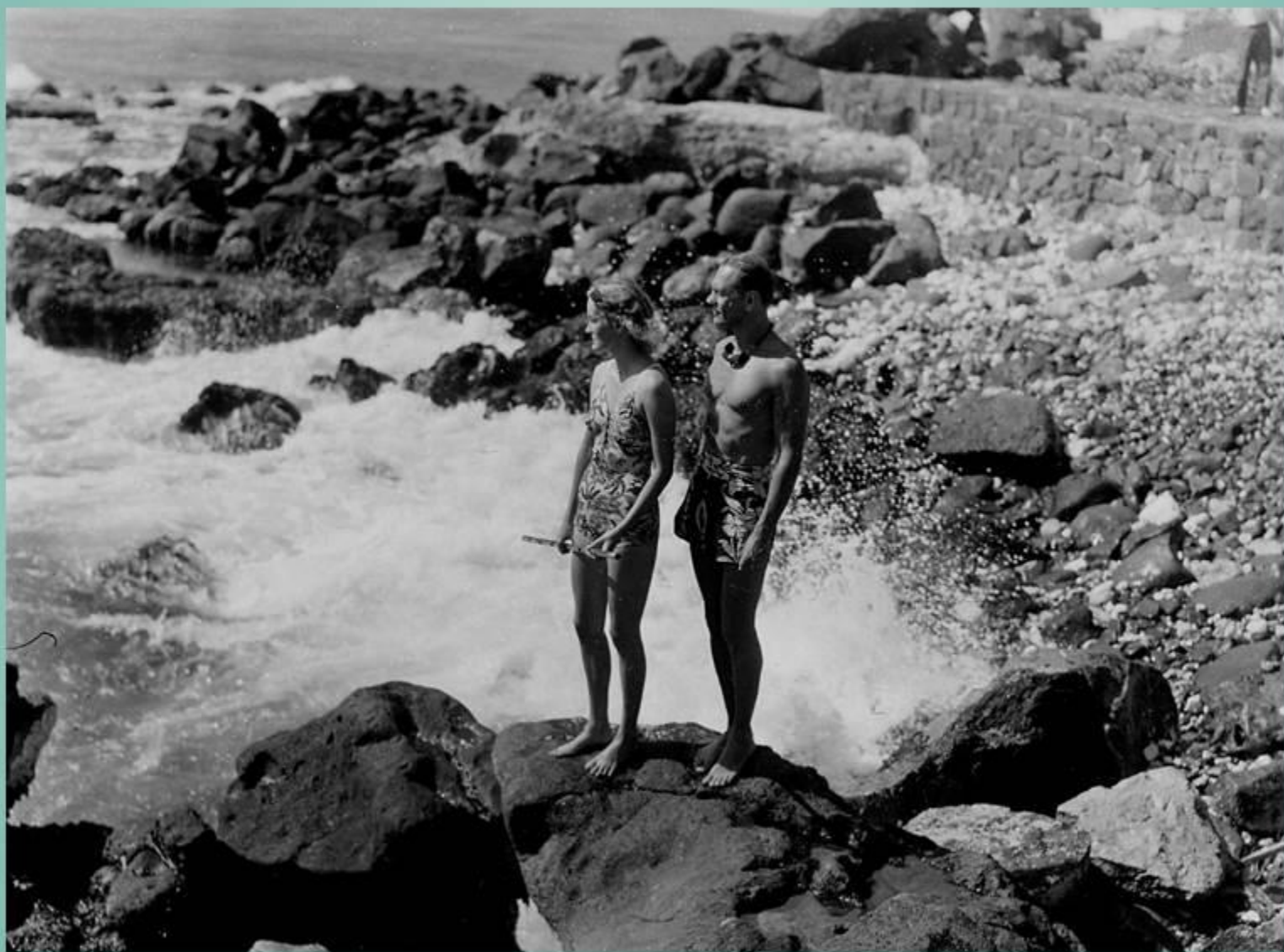
March 1939.