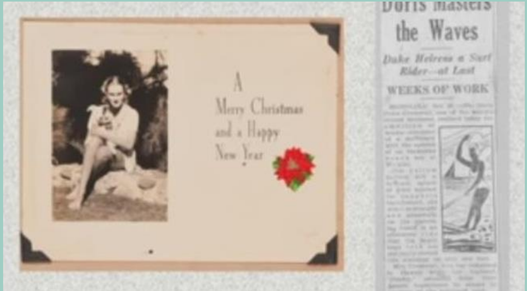
Doris Duke and dog, ca. 1935.